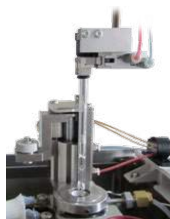
LINEX, Automatic liner exchanger

With LINEX it is also possible to store the liner with caps, the caps are removed by the capping/de-capping station and placed into the OPTIC inlet. Next could be a liquid injection of an internal standard. The solvent of the standard will be vented away and the TD tube will be heated.