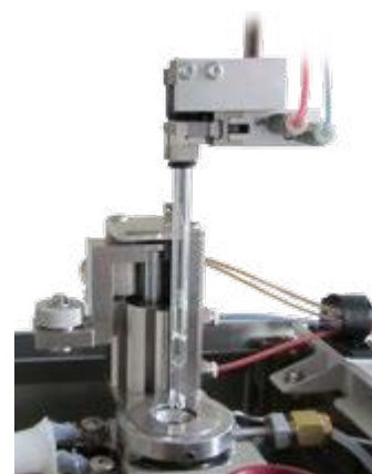
LINEX, Automatic liner exchanger