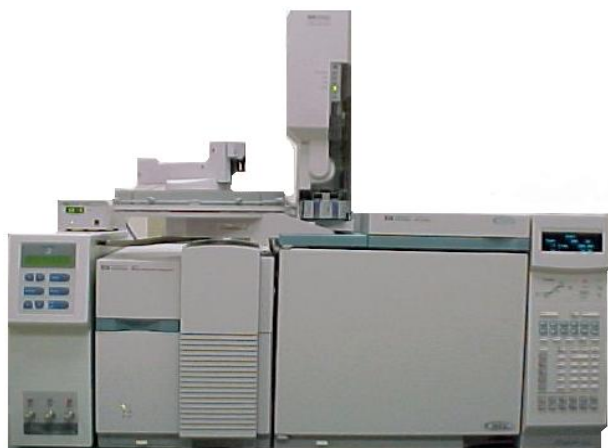
HP6890/5973 with OPTIC2 8270 Injection System

1 USEPA SW-846, Method 8270C, Revision 3, December 1996.